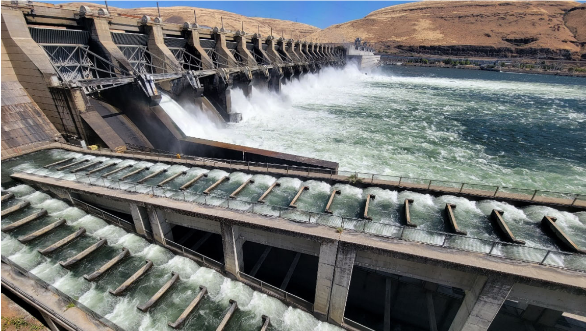
South View of John Day Dam

Bonneville Power Administration U.S. Bureau of Reclamation U.S. Army Corps of Engineers